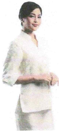
Slight Left Tilt