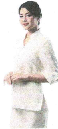
Slight Right Tilt