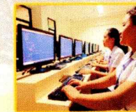
COMPUTER PROGRAMMING (.NET TECHNOLOGY) NCIII