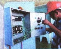
ELECTRICAL INSTALLATION & MAINTENANCE NC II & NC III