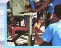
PLUMBING NC II