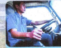
DRIVING NC II