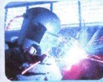
SHIELDED METAL ARC WELDING NC I & NC II