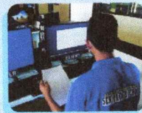
COMPUTER SYSTEM SERVICING NC II