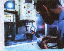
CNC MILLING & LATHE MACHINE OPERATION NC II