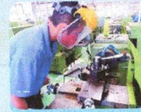
MACHINING NC I & NC II