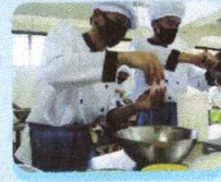
BREAD & PASTRY PRODUCTION NC II