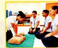
CAREGIVING (ELDERLY) NCII