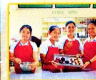
BREAD and PASTRY PRODUCTION NCII