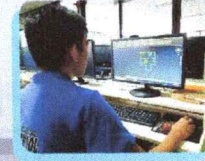
TECHNICAL DRAFTING NC II