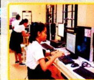
COMPUTER SYSTEM SERVICING NCII