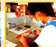
ELECTRONIC PRODUCT ASSEMBLY and SERVICING NCII