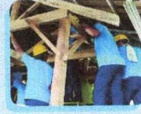
CARPENTRY NC II