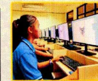
VISUAL GRAPHICS DESIGN NCIII