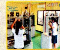
MECHATRONICS SERVICING NCII