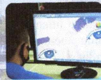
VISUAL GRAPHICS DESIGN NC III