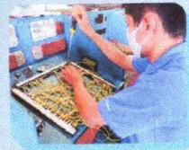
AUTOMOTIVE SERVICING NC II