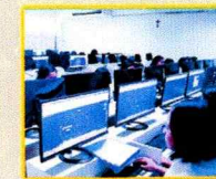
TECHNICAL DRAFTING NCII