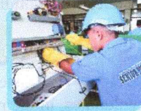
MECHATRONICS SERVICING NC III