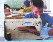
TAILORING NC II