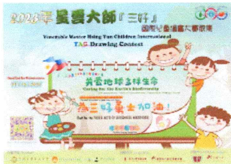
A3 size_2023 I TAG Drawing Contest.png 18744K