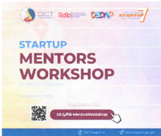
Mentors Workshop CA.jpg 393K