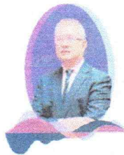
Hon. Fortunato T. de la Peña Secretary, DOST