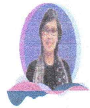
H.E. Lenny N. Rosalin Deputy Minister for Gender Equality, Ministry of Women's Empowerment and Child Protection in Indonesia Topic: "Promoting Gender Equality in STEM for Sustainable Development"